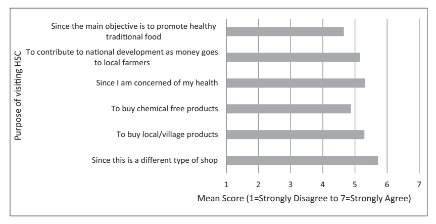
Figure 1: Purpose of buying at HSC

Figure 1 shows the reasons why consumers shop at Gannoruwa HSC. The respondents were asked to select their reason from a list of statements, developed from the goals of the HSC and general customer reviews, which have been given in the vertical axis of Figure 1. Responses are ranked on a Likert scale ranging from 1 (strongly disagrees) to 7 (strongly agree). They